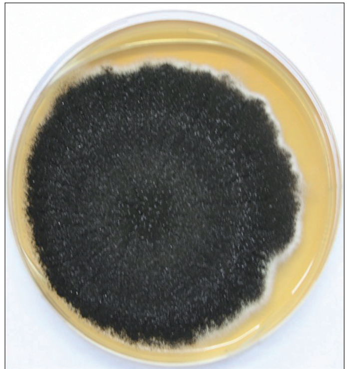
Figure 2: Appearance of standard plate culture after two days of inoculation with the same sample.