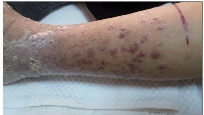
Figure 1: Reddish-brown patches and crusts of KS lesions on the skin.

In conclusion, immune dysfunction is strongly correlated with KS and CRF may lead to both immunosuppression and chronic inflammation. Additional factors such as chronic venous stasis