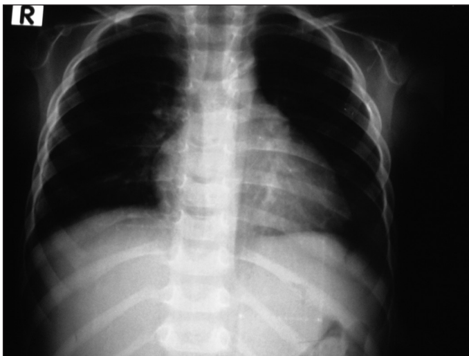
Figure 2: X-Ray after treatment.